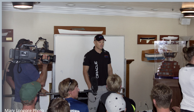
Marv Longore Photo

The 12 competitors and 3 alternates will be chosen by the Governor’s Cup Selection Committee based on a Request for Invitation which includes a sailing resume. The winner of the Rose Cup, a national youth match racing event for US competitors will receive an automatic invitation. (For more information on the Rose Cup which will be held June 19-23, 2013 in Sheboygan, WI, go to http://sailsheboygan.org/Rose-Cup-2013.php .